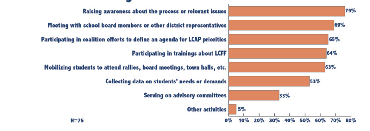
Figure 1. Youths' Roles in LCAP Efforts

in a third of organizations, youth sat on advisory boards that helped define budget priorities. Needless to say, LCFF has provided youth organizations with early exposure to government decision-making processes.